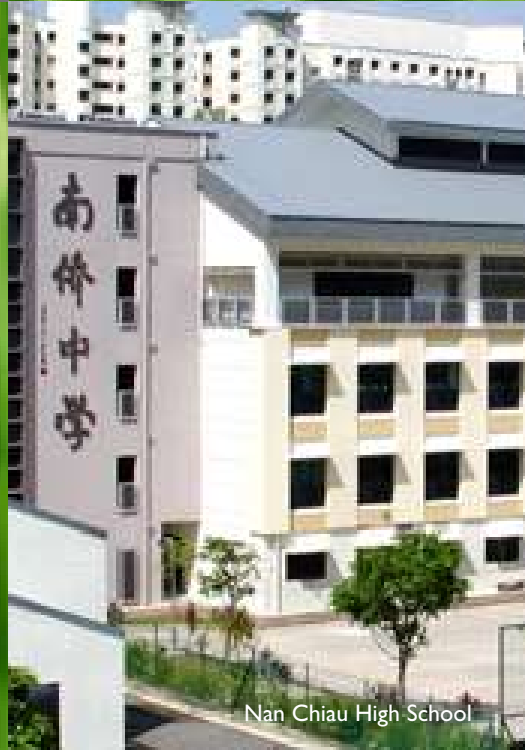
Nan Chiau High School