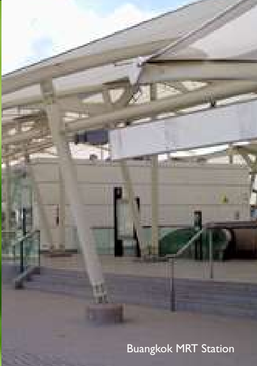
Buangkok MRT Station

Strategically located between Hougang Estate and Sengkang Estate, the site has convenient access to the Central Expressway (CTE) and Tampines Expressway (TPE). It is also well-served by the public transportation system, and Buangkok MRT station on the North East Line.